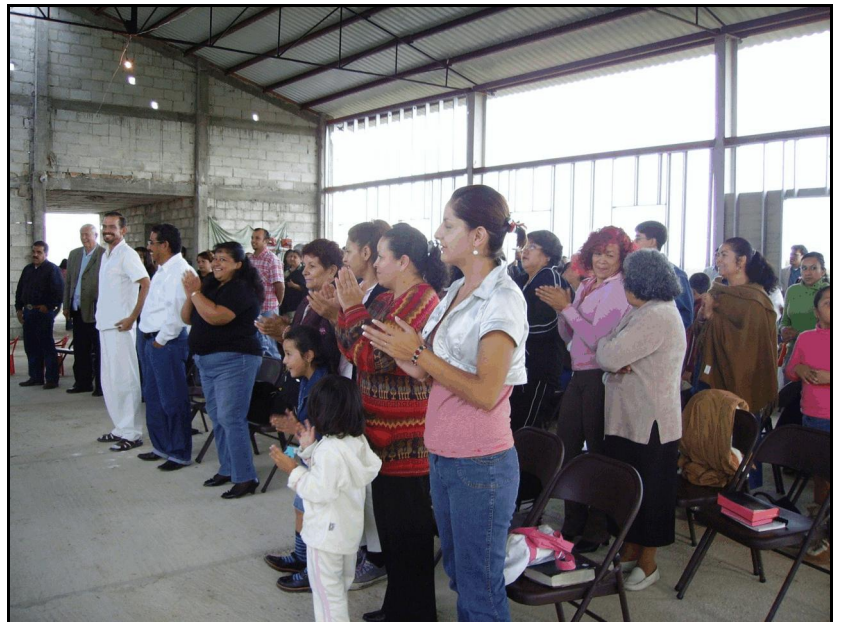
Partially completed Eternal Refuge Church

It's good when church members help build their own church. We feel the church really becomes their own when they do. It is exciting to see how happy the congregation at the Eternal Refuge Church is to have even an unfinished building for their services.